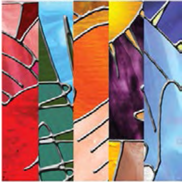
Vision Mission Values

At St. Paul's Hospital, we believe people do their best work when they are working within a system where core values are shared by all.